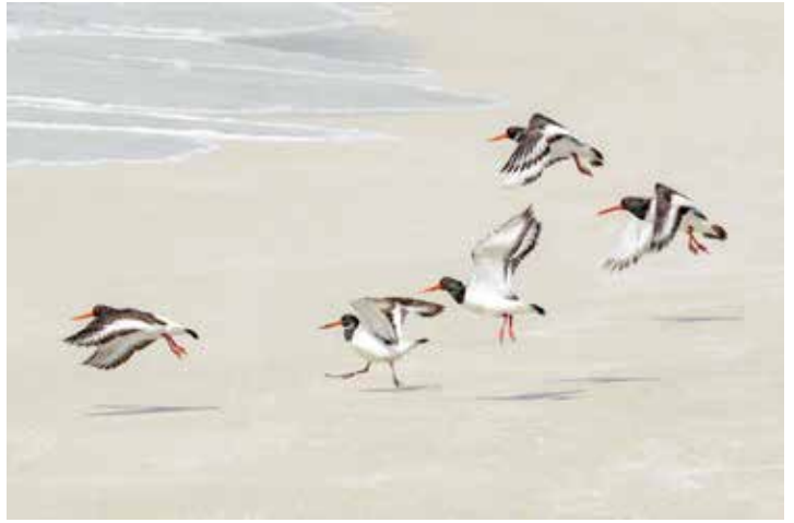
James Morecroft High Peak PC (L&CPU) “Oystercatchers Taking Flight”