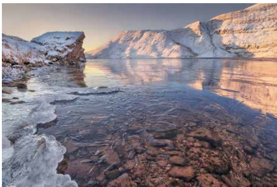
"Llyn Y Fan Fawr at First Light"