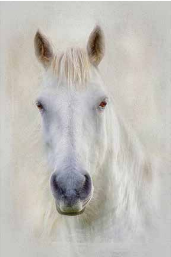
Gaile Gray Carlisle CC (SPF) "White Horse Portrait"