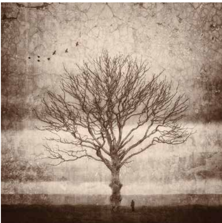
Ilkley CC (YPU)