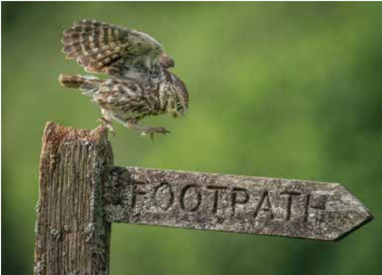
Simon Beynon Chesterfield PS (N&EMPF) "On the Right Path"