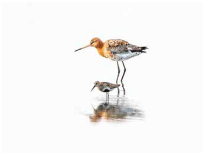
Helen Higgs bh PC (SCPF) “Little and Large”