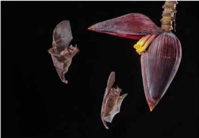
Royston Packer DPAGB Doncaster CC (YPU) "Pallas Long-tongued Bats"