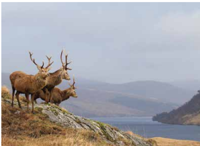
Judith Greaves Bingley CC (YPU) “The Three Tenors”