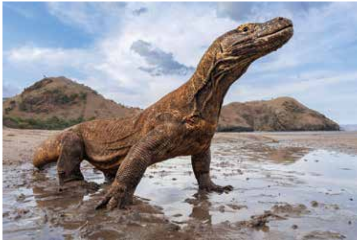
Louise Moon High Peak PC (L&CPU) “Komodo Dragon”