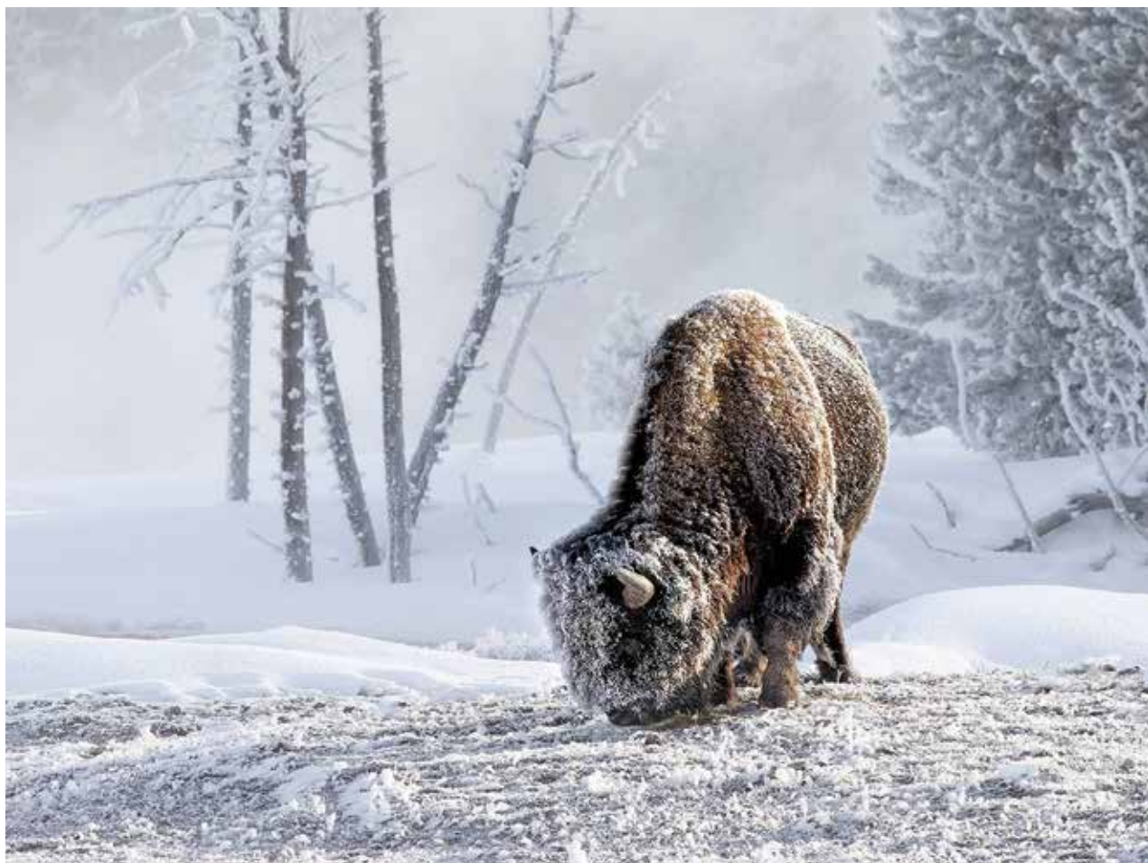
“Bison Foraging in Snow”