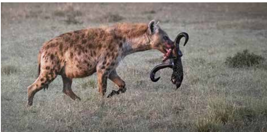
Maureen Toft MPAGB EFIAP/d3 MPSA Southampton CC (SCPF) "Hyena with Buffalo Horns"