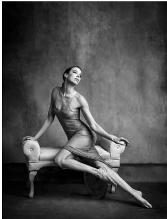
Joseph Vize Catchlight CC (NIPA) “Enraptured”