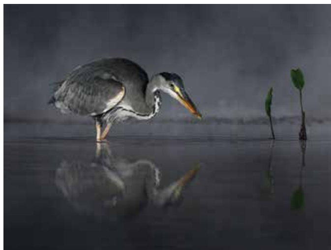
Colin Bradshaw DPAGB EFIAP BPE5* PIC (EAF) “Grey Heron in Mist Eating Fish”