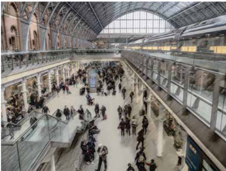
Glynis Harrison LRPS Solihull PS (MCPF) "St. Pancras Station"