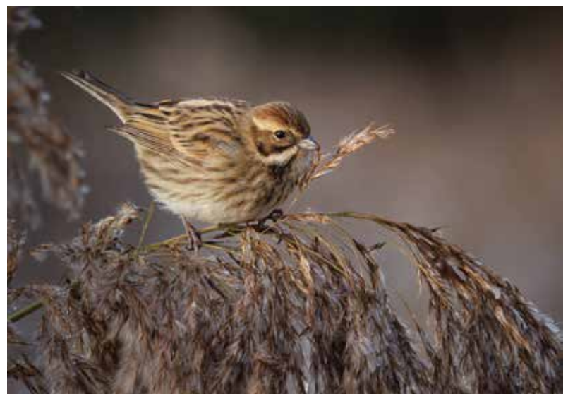
"Reed Bunting on Winter Reeds"