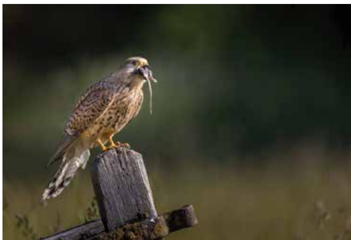
Kevin Maxfield Deepings CC (N&EMPF) “Kestrel with Prey”