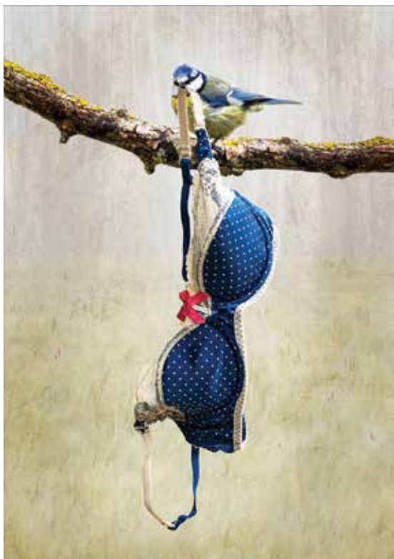
Jane Lee DPAGB DPAGB/AV EFIAP BPE3* Dorchester CC (WCPF) "Blue Tit with Nesting Material"