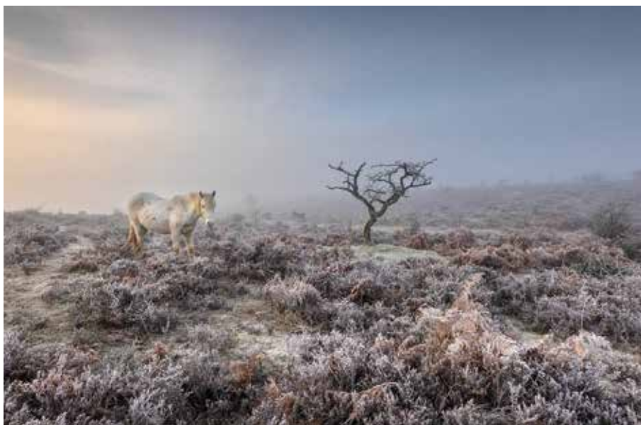
CERTIFICATE Ferg Cowhig New Forest CC (SCPF) "New Forest Pony in Misty Dawn"