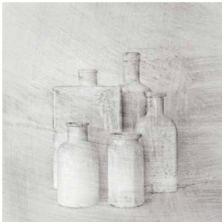
Stan Farrow FRPS DPAGB EFIAP St. Andrews PS (SPF) "Five Old Bottles"