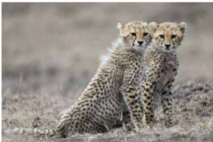
Monica Doshi Arden Photo Group (MCPF) “Cheetah Cubs”