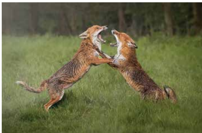
Julia Wainwright FRPS MPAGB AFIAP BPE3* Chichester CC (SCPF) “Wet Foxes Fighting”