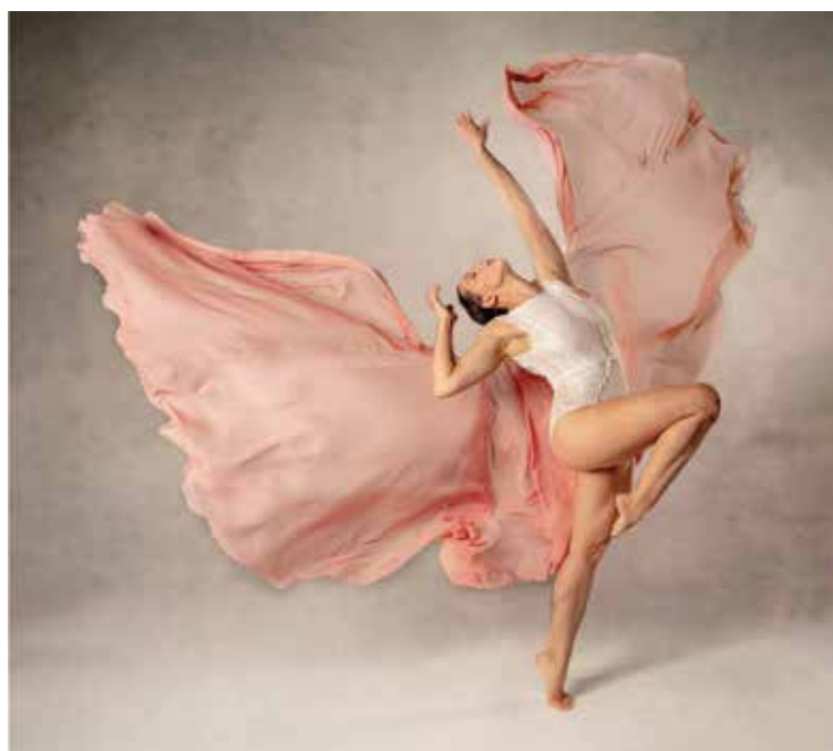
Earl Shilton CC (MCPF)