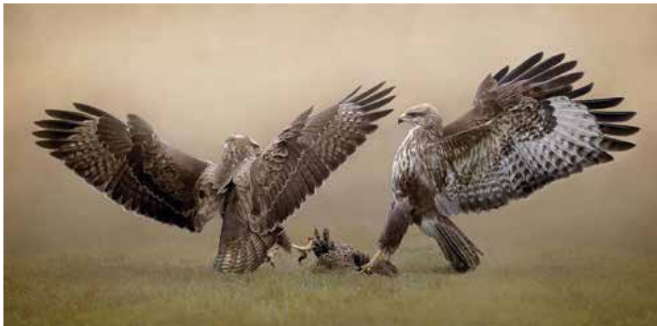
“Buzzard Fight”