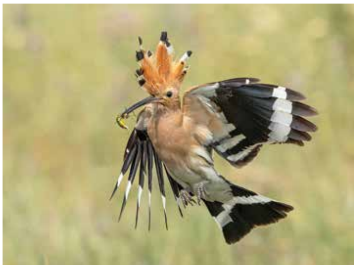
Jamie Macarthur DPAGB Rolls-Royce Derby PS (N&EMPF) “Hoopoe in Flight”