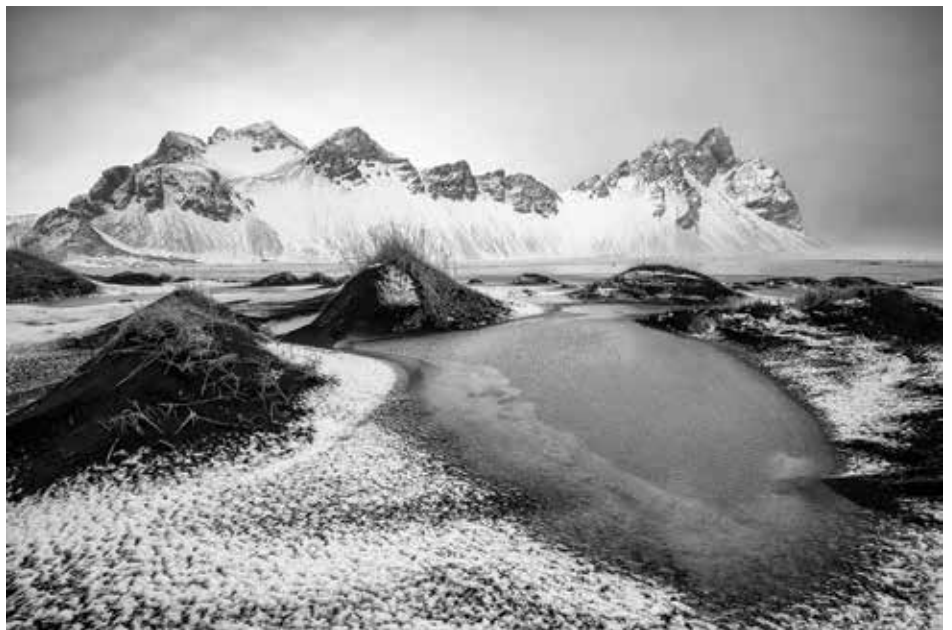
Nicky Rochussen ARPS Epsom CC (SPA) “The Frozen Beach at Stokknes Peninsula”