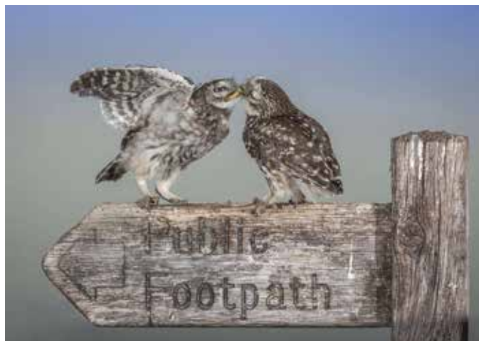
Sue Critchlow ARPS DPAGB EFIAP BPE5* Southport PS (L&CPU) “Little Owl Feeding Chick”