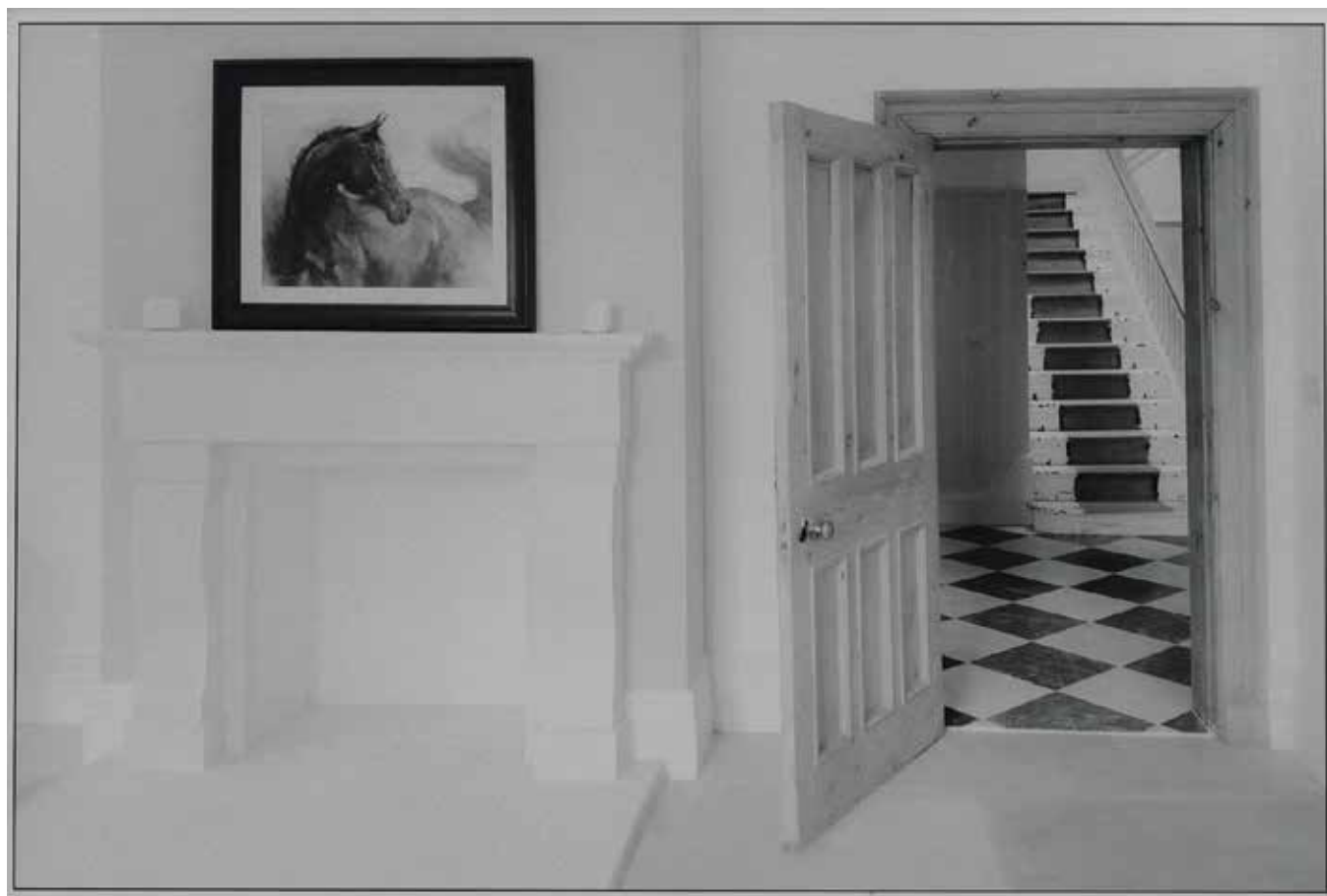
PAGB Ribbon Ralph Duckett MPAGB EFIAP APAGB Burton on Trent PS (MCPF) "The White Room"