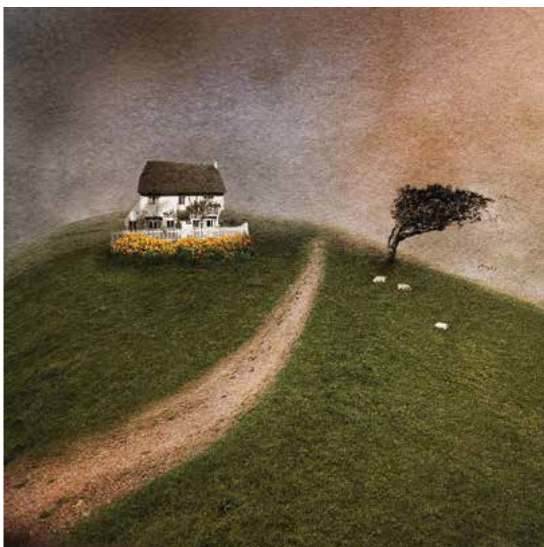
New Forest CC (SCPF)