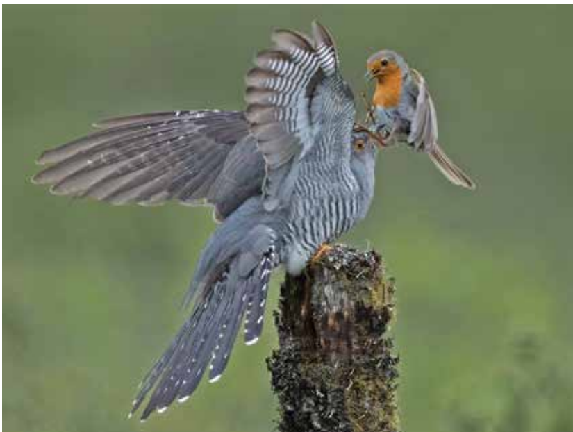
Tenby & District CC (WPF)