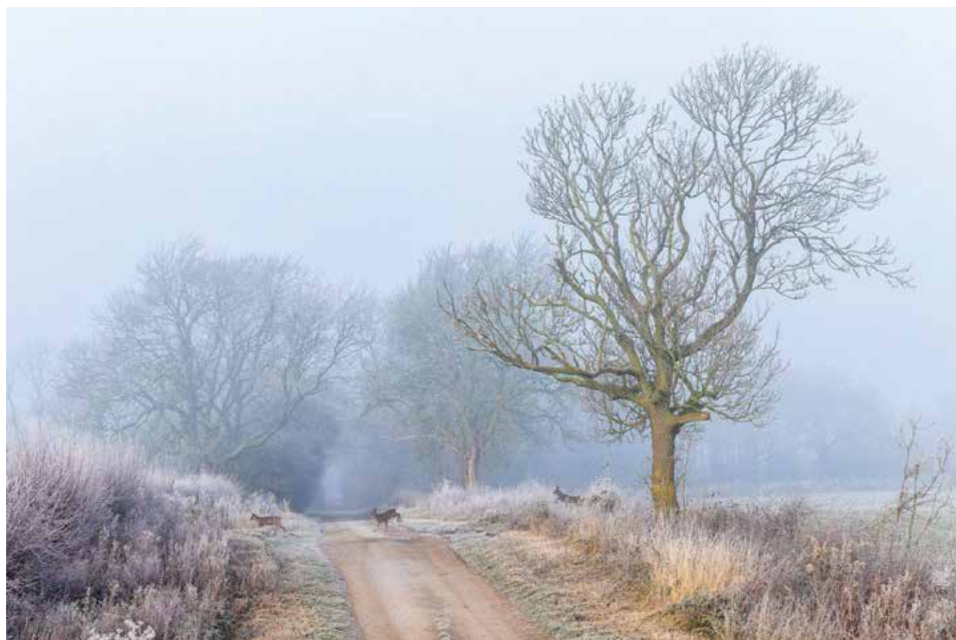
PAGB Ribbon York PS (YPU)